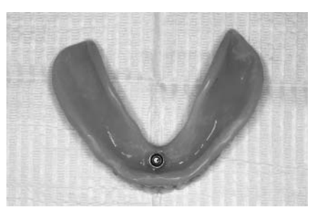
the retentive fixation part

Implant stability results are presented in Table 1. Statistically significant dynamics in each group (F=25.47; p<0.001) was seen, and there were no differences in dynamics between groups (F=0.001; p=0.93). The average implant stability in 12 months began to