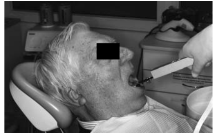
Fig 1. Performing measurements of the im- Fig 2. Measurement of the fixation degree