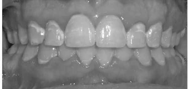
Fig. 1. Frontal view with WSLs visible on teeth

principle search terms: "white spot lesion", "caries", "decalcification", "demineralisation", "fluoride", "orthodontic treatment complications", "fixed appliances", and "casein phosphopeptide-amorphous calcium phosphate". Abstracts formed a list of potentially relevant studies. The initial search for literature in the English language published between 2008 and 2013 retrieved 177 papers. Three researchers independently reviewed the titles and abstracts of potentially relevant studies. Where it was apparent from the abstract that the study subjects were inappropriate for the focus of the review (in terms of the exclusion criteria), full-text articles of these studies were not included. The reference lists of articles which were eligible for the review were checked. In the end, 11 clinical studies fulfilled the inclusion criteria (Figure 2).