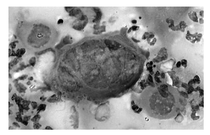
Fig. 2. Squamous cell carcinoma arising in the tongue. Brushing cytology. Papanikolaou stain ×500.

The aspirations were performed using a Cameco (Taby, Sweden) syringe pistol with a 20-ml disposable plastic syringe and needles with 0.4-0.7-mm outer diameter. A gynecologic cytobrush (Fig. 1) was used to perform the brushings. Aspirates and brushings were prepared as air-dried smears or fixed in 95% ethanol. May-Grunwald-Giemsa (MGG) and hematoxylineosin (H&E) stains were applied, respectively. Histological sections for routine evaluation were stained with H&E. In addition, immunohistochemical staining was performed. A three-step peroxidase or alkaline phosphatase antialkaline phosphatase immunostaining was used according to a protocol described previously (13,14). The following antibodies were used: Cytokeratins (CK) [pan-CK, CK CAM 5.2, and CK AE1/AE3], anti-kappa, anti-lambda, CD45 (leukocyte common antigen-LCA), CD3, CD10, CD20, Bcl-2, and EBV latent membrane protein.