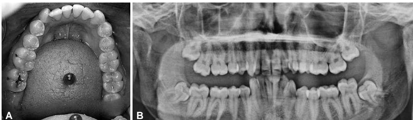
Fig. 1. Initial clinical (A) and radiological (B) view of the anterior crowding in the lower anterior segment