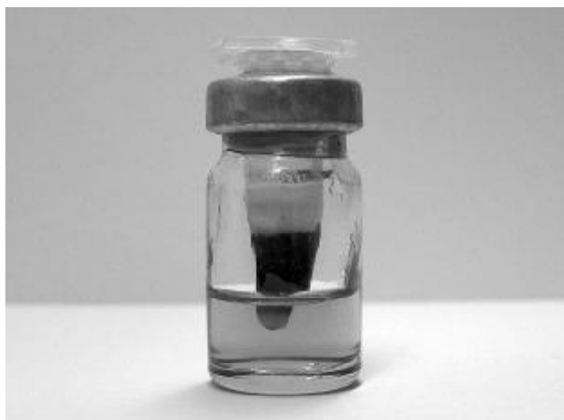
Fig. 1. Experimental apparatus

bond between sealer/dentin and sealer/gutta-percha, methacrylate resin coated gutta-percha cones (EndoREZ® Points, Ultradent Products, Inc., South Jordan, Utah, USA) have recently been introduced [12].