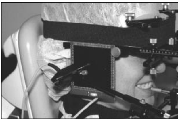
Figure 1. Computerized axiography adjusted to head of patient.

Three (lateral, central und medial), 3 mm orthogonal sagittal images of the TMJ were obtained with the jaw in the maximal intercuspal position (MIP) and then at maximal opening. The position of the articular disk was determined in both cases, when the mouth was closed and when it was