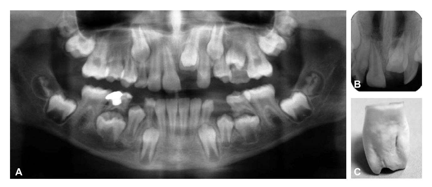
Fig. 1. Impacted central maxillary incisor due to supernumerary tooth: A – orthopantomogram with impacted upper left central maxillary incisor; B – intraoral roentgenogram with clear view of supernumerary tooth; C – supernumerary tooth.

impaction caused by supernumerary teeth. Spontaneous eruption of the impacted maxillary incisors there are no doubt has an advantage over its surgical-orthodontic treatment approach. But is it possible to predict spontaneous eruption of impacted maxillary incisor and its timing after removal of the supernumerary tooth? There is no clear answer yet, because a lot of factors, such as initial location and axial inclination of impacted teeth, lack of space in the dental arch and many others can influence the process [10,11].